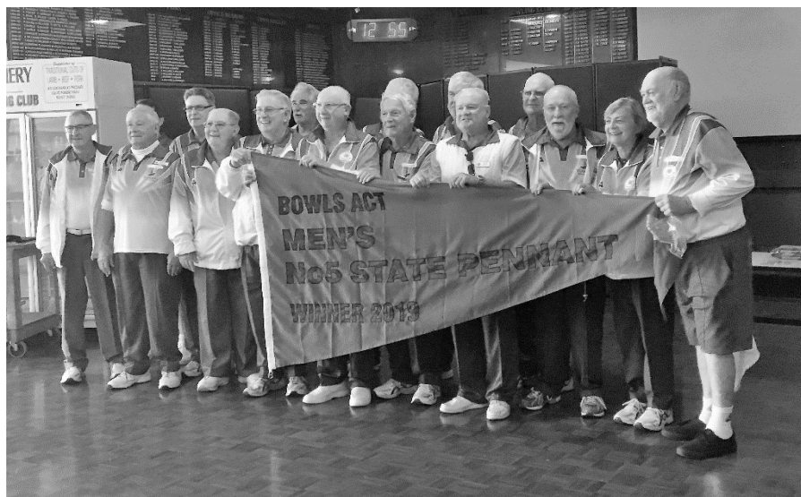
Winners, Men's Pennants Division 5 - 2019