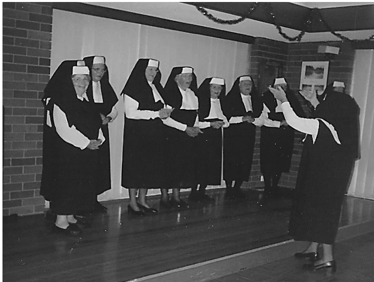
Yowani Women's Christmas Party 2002 - 'The Nun's Chorus'