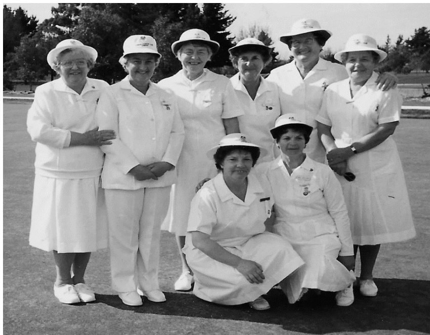
Doran Winners 1991

The population of Australia was 16.5 million