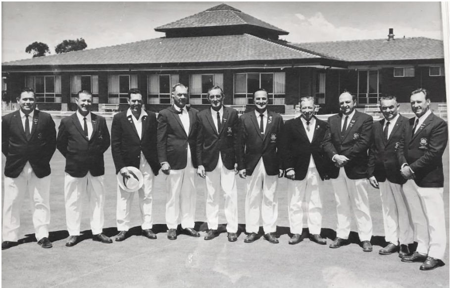
Winners, Men's Pennants Division 8 - 1969/70