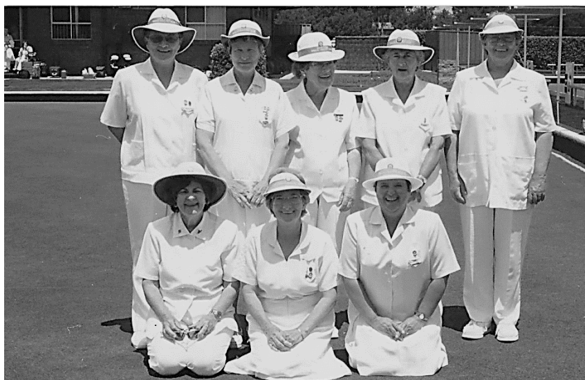
Winners, Women's Pennants Division 4 – 1999

Most members will be aware that we have a library of donated books in the Bowls kitchen cupboard. This was started informally many years ago by the women bowlers, and was originally held by individual members who brought the books in for swapping on bowls days and then took them home again. When a bowls shed was erected over near the Green Keeper's shed, the books were then stored there – more convenient, but still a nuisance carting them back and forth. Then a kitchen cupboard became available and thankfully it was moved there – because very shortly after the bowls shed was demolished by a wind storm, which deposited the shed's contents onto Green 1 and into the car park, fortunately without the many dozens of books as well!