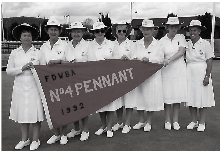
Winners, Women's Pennants Division 4 - 1992